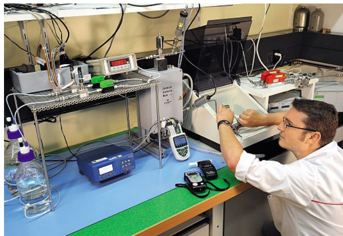
The generator for wet breath-alcohol analysis built at METAS.

The SI-traceability of the breath-alcohol tests results is desirably ensured without the OIML-convention. [1,3,4]